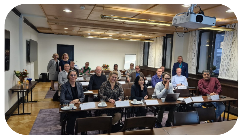
Thank you, International Institute for Learning (IIL) , for collaborating with us to make this event possible.